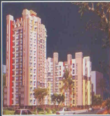
Completed Vedant Goregaon (West) (1,10,000 sqft.)