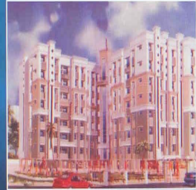
Completed Prathmesh Park Andheri (W) (70,000 sqft.)