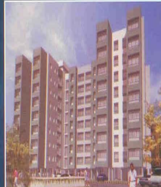
Completed Akshar Apartments Kandivali (West) (52,392 sqft.)