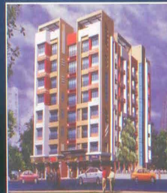
Running Vishwa Mangal Goregaon (W) (70,000 sqft.)