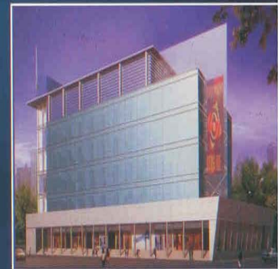
Running Janaki Plaza Santa Cruz (W) (80,000 sqft.)